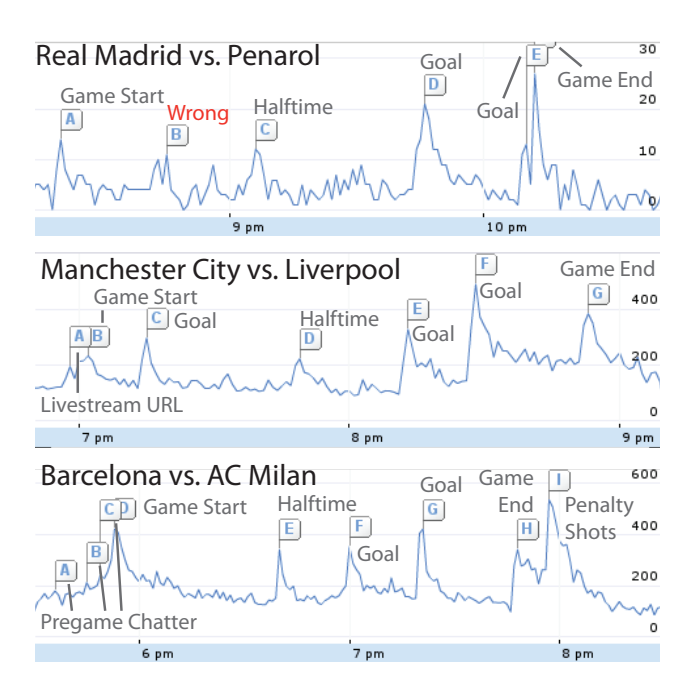
Figure 3. The TwitInfo timeline displaying three soccer games. The peak detection algorithm finds only 1 false positive, labeled red. The algorithm did not find Yellow Card events, but there was no spike in Twitter usage to suggest it. The algorithm occasionally flagged pregame chatter like retweeting a livestream URL.

Precision depended on activity type: it was high for soccer, but there were several false positives for major earthquakes because the algorithm also flagged minor earthquakes. If we include in our ground truth dataset all minor earthquakes, precision rises from 14% to 66% (Table 1). It still produces false positives, because Twitter spikes when its users discuss an earthquake or share information about donating aid money. If we include all earthquake-related discussion, precision rises to 89%. Likewise, including soccerrelevant discussion (like conversations identifying live video stream URLs for a game) leads to 95% precision in the soccer dataset. The remaining false positives come from highvolume topics that happened to mention the word earthquake or a soccer term. For example, one Twitterer asked celebrity Justin Bieber to follow her because she survived Chile's earthquake, and she was retweeted around Bieber's fan base.