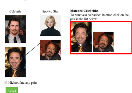
Figure 3: A join task can take several forms as a HIT. In this example, turkers are asked to selet matching pictures in each column.

Figure 3 shows the two-column join interface for implementing joins in Query 2.