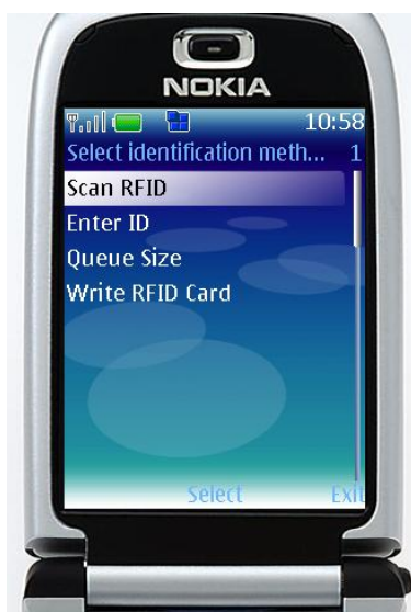
Fig. 3. The physician is presented with the option to scan an NFC tag or enter a patient ID manually.

At clinic locations, we need to expect unreliable electricity and little or no wired internet availability. However, all of these locations have reliable cell phone signals and sufficient GPRS connectivity to support basic web-based applications. As such, a cellphone-based approach would be ideal for such locations, as the battery on the phone would be resilient to power outages, and the GPRS connection on the phone would support all data transfer needs.