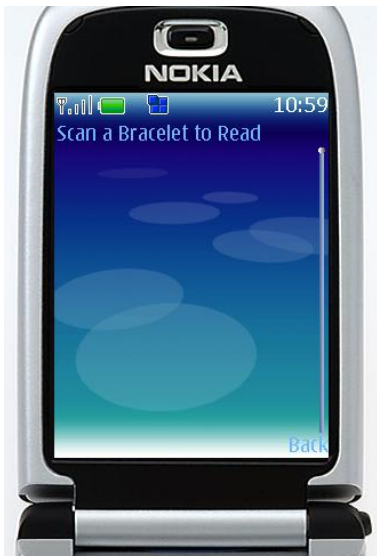
Fig. 4. If the physician selects the option of scanning the NFC tag, he or she is prompted to tap the NFC tag onto the cell phone for reading.