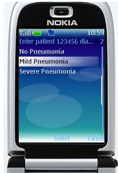
Fig. 5. After tapping the NFC tag, the physician is asked to enter the patient diagnosis on the cell phone.

tag scanning and manual entry are described in Step 1 of the interaction diagram in Figure 2.