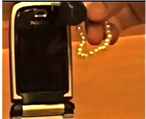
Fig. 6. A bracelet with an NFC tag.

One implementation hurdle of the system is that HTTP over GPRS is unreliable, and we have seen diagnosis messages hang or be dropped. To ensure reliable delivery, and to avoid locking the doctor's screen while the transmission (which may take several seconds) is processed, we instead utilize the J2ME records system to create a record for each diagnosis, which is safely and transparently written to the local file system of the phone. A background thread will be woken up when a new record is added to the file system, and will loop continuously until a successful response is confirmed by the HTTP GET. In this way, all messages will be sent as soon as a connection allows, and the doctor will not be forced to wait while transmitting the message. We also have a version of the midlet which uses SMS to send the data from the phone to the central server.